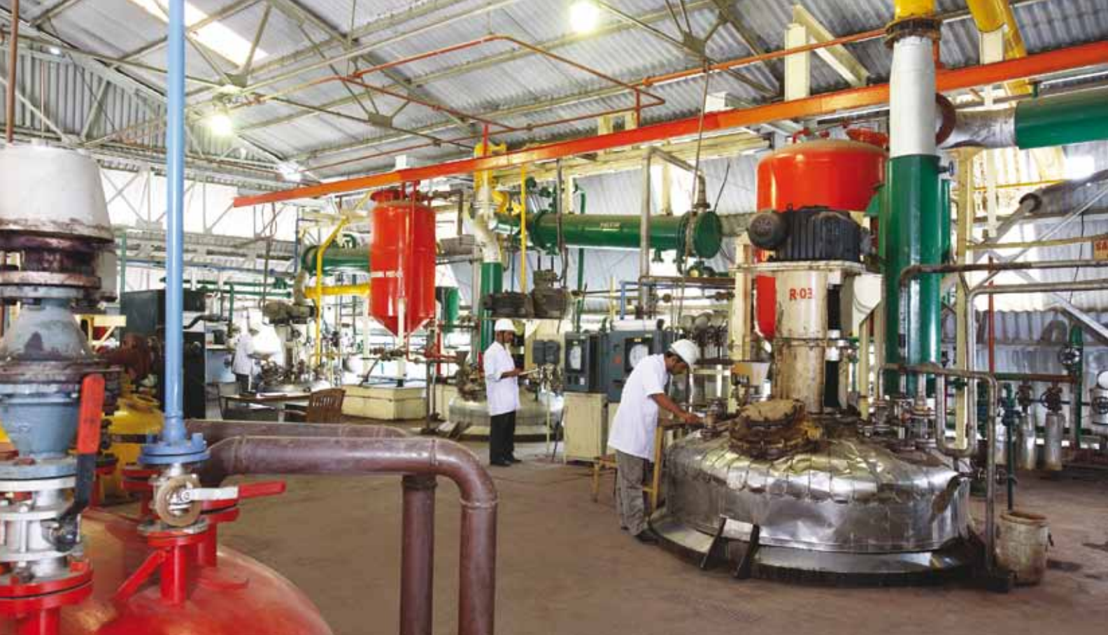
GHA Plant - Nerul, New Mumbai