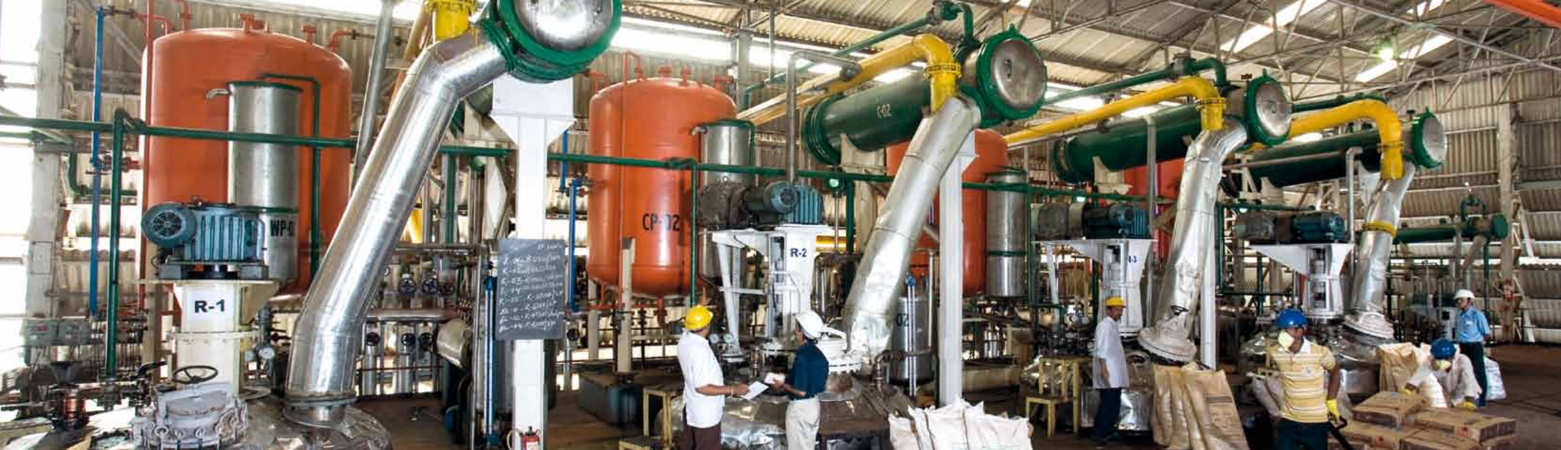
GHA Plant - Khopoli