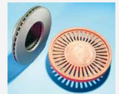
GHA plant - Khopoli

This is a two part system of Resin & Activator used for the mould and cores production suitable for Ferrous, Steel and Non-Ferrous Castings. Reclamation property upto 90% and high hot strength compared to phenolic acid cured. We have different grades having Nitrogen level 0-12%. Kaltharz-70 P, 9011, 90IC, U185, U265 are Furan Resin (Part-I) & Activator 100 T3 is the common acid catalyst.