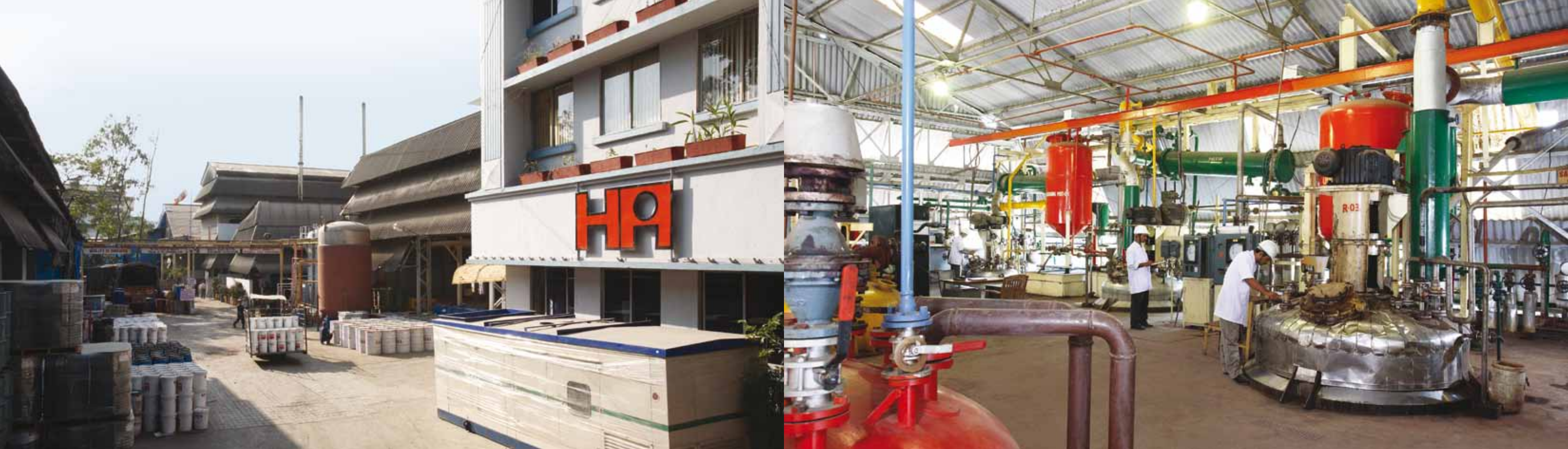
GHA Plant - Nerul, New Mumbai